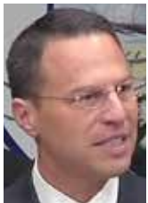
Attorney General Josh Shapiro

WASHINGTON – The report begins dramatically, imploring its readers: "We, the members of this grand jury, need you to hear this." Plain and simple, at least 1,000 children identified in the investigation were raped in Catholic places of worship, in schools, and in diocesan owned vehicles, and were "groomed" through diocesan programs and retreats so they could be molested, wrote members of a 23-person grand jury who heard those accounts over